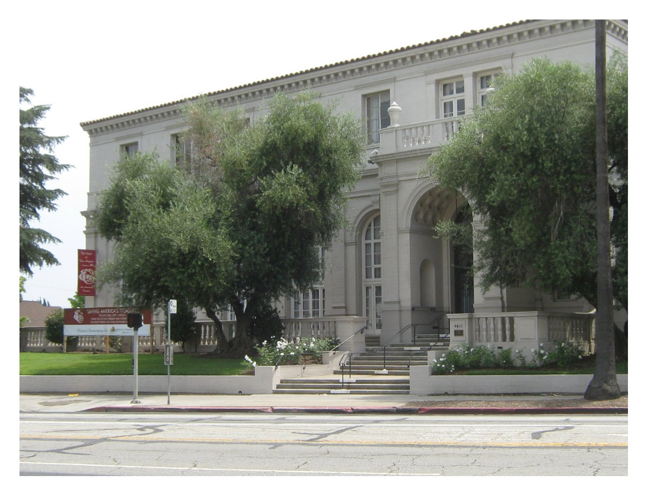
The Ebell of Los Angeles entrance at Wilshire Boulevard. July 20, 2013.