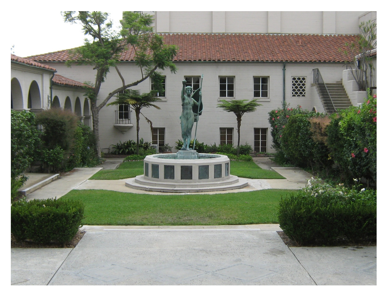
The Ebell of Los Angeles. Patio Garden, facing south. Statue by Henry Lion. July 11,2013