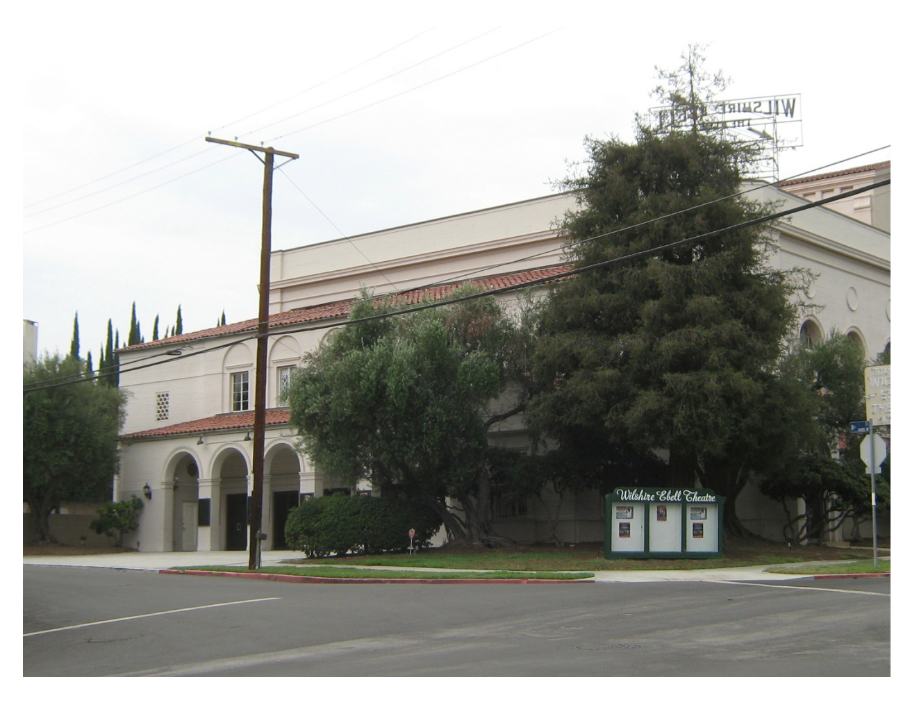
The Ebell of Los Angeles, south elevation, The Wilshire Ebell Theatre entrance. July 11, 2013.